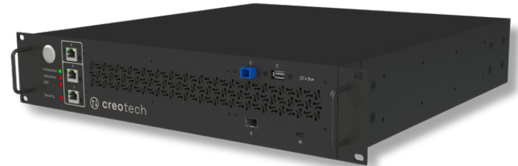
QKD module, 2U design