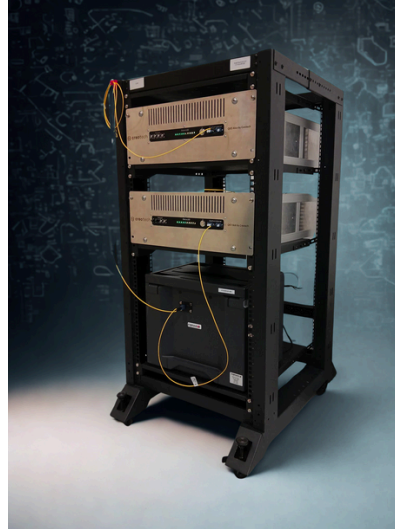
The QKD prototype system – Creotech lab

Our solution is 100% European. Both our company and our technical expertise – including electronics – are Polish.