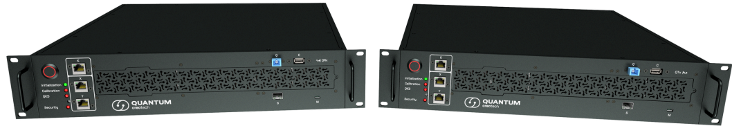
QKD module, 2U design