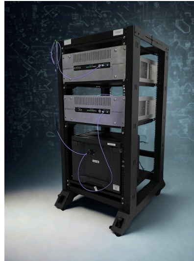
The QKD prototype system – Creotech Quantum lab

Our solution is 100% European. Both our company and our technical expertise – including electronics – are Polish.